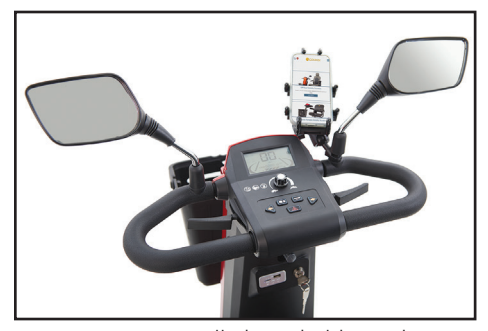
Rear view mirrors, cell phone holder and built-in speaker system with Bluetooth® & USB connectivity.