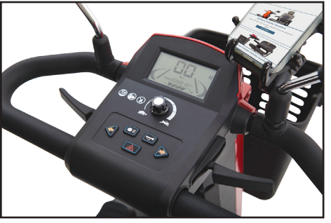
Integrated LCD console display monitors speed, odometer, fault codes & battery life.