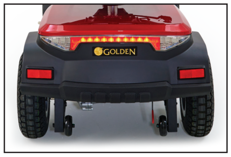
Ultrabright LED rear lights.