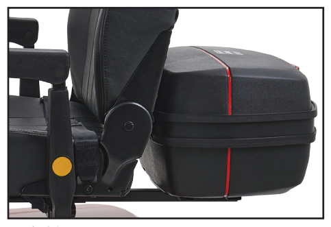
Lockable water-resistant storage compartment comes standard and attaches to the accessory bracket.