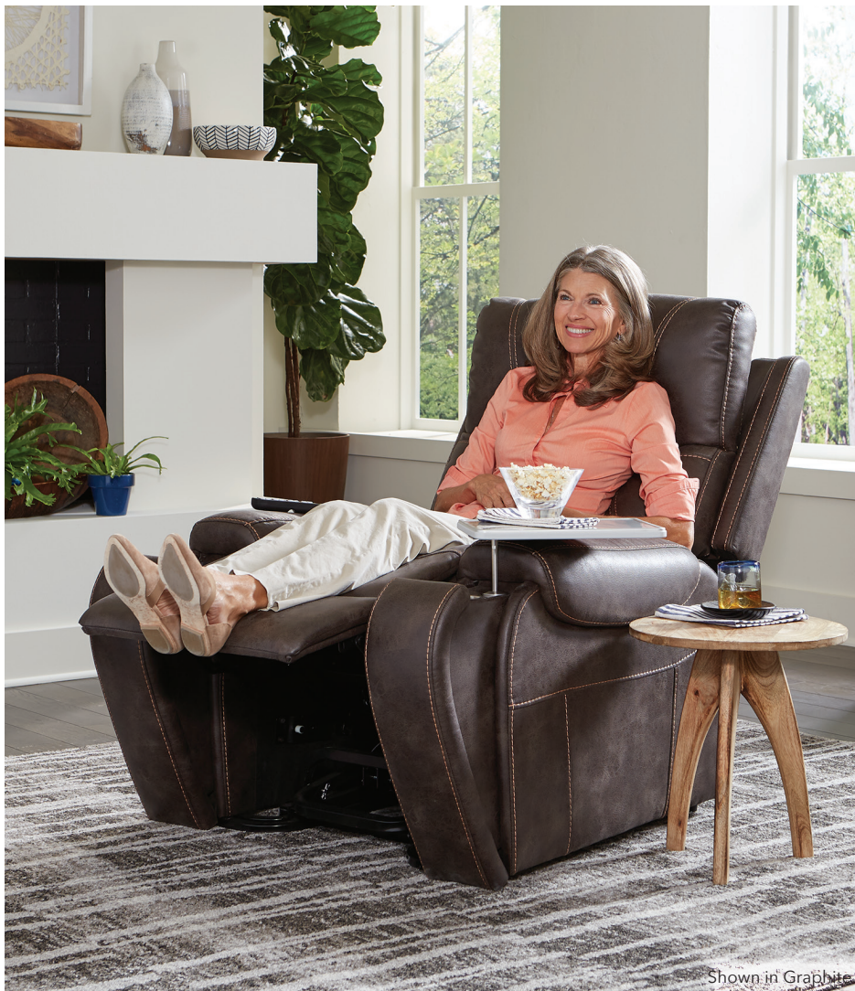
Shown in Graphite