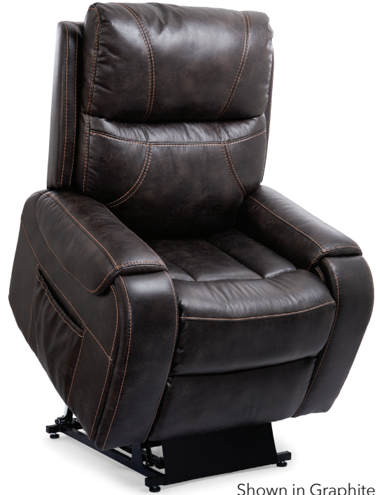
Shown in Graphite