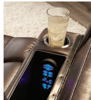
Right Arm: Cup Holder & Storage Compartment

The Rhea comes standard with the following comfort and convenience features: