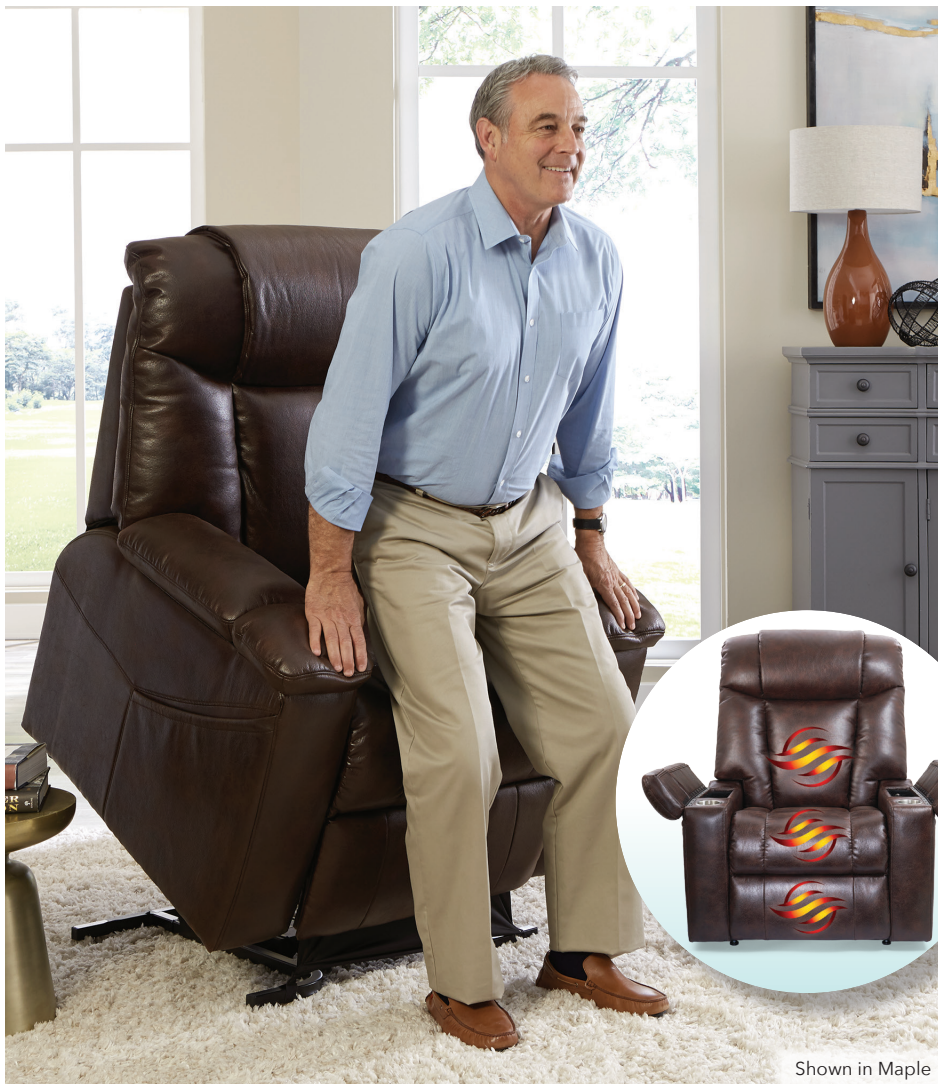
Shown in Maple