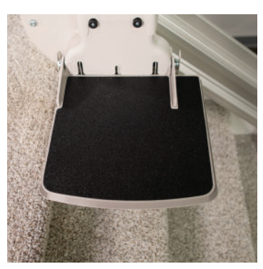
Not all options are shown.